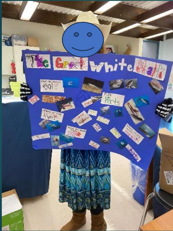
I researched Great White Sharks