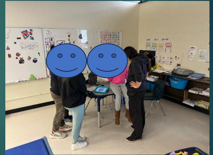
I shared my story